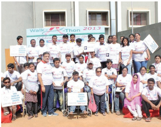
Members of Enable India at the Walkathon

'Better employment opportunities for the disabled' was the noble purpose behind this Walkathon. In fine tune with this theme, the event was organised in association with 'Enable India', a leading NGO empowering disabled people to be employable.