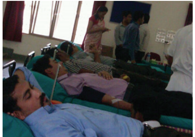
Volunteers donating Blood