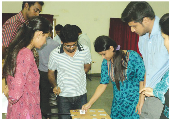
Students participating in Theatrix