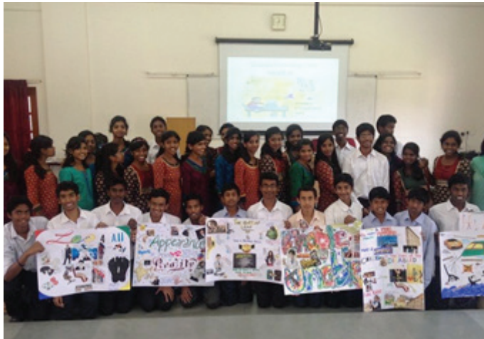
Children from Shanthi Bhavan displaying at XIME the posters made by them