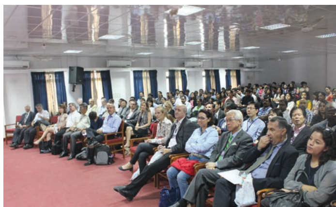
Delegates of Eduniversal