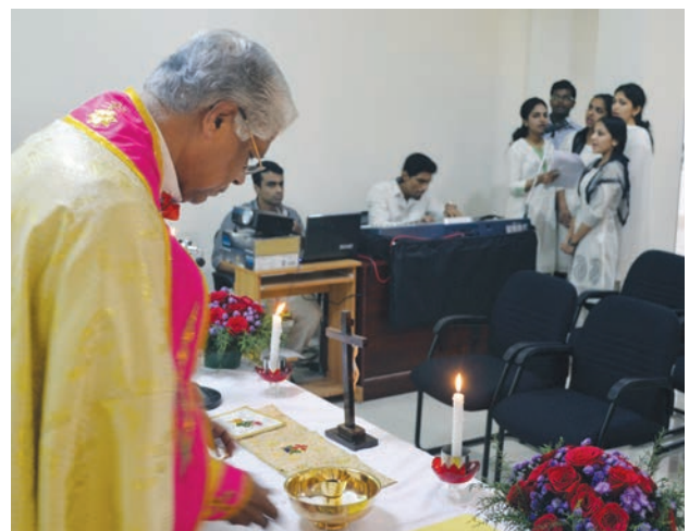
Solemn Mass during St. Xavier's Day XIME Kochi