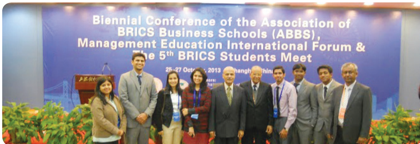
XIME representatives at the Conference