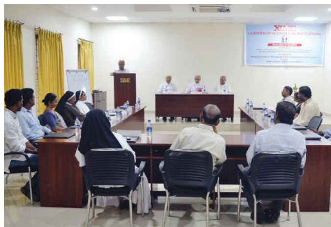
A session in the Leadership Programme organised for College Principals

A three day Leadership Programme for Administrators of Catholic Colleges was organized by XIME in collaboration with the Higher Education Board of Syro – Malabar Church, during November 21- 23. Fourteen administrators from some of the leading colleges attended. Resource Persons included