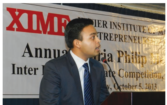
Winners - IIM-B team