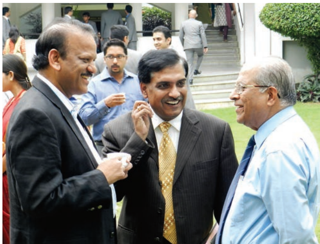
A lighter moment at the Colloquium

In a nutshell the Colloquium was a great learning experience for all the participants.