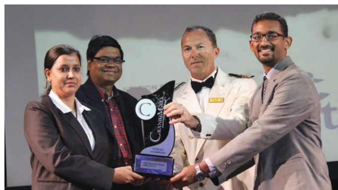
XIME team receiving the overall Champion's Trophy