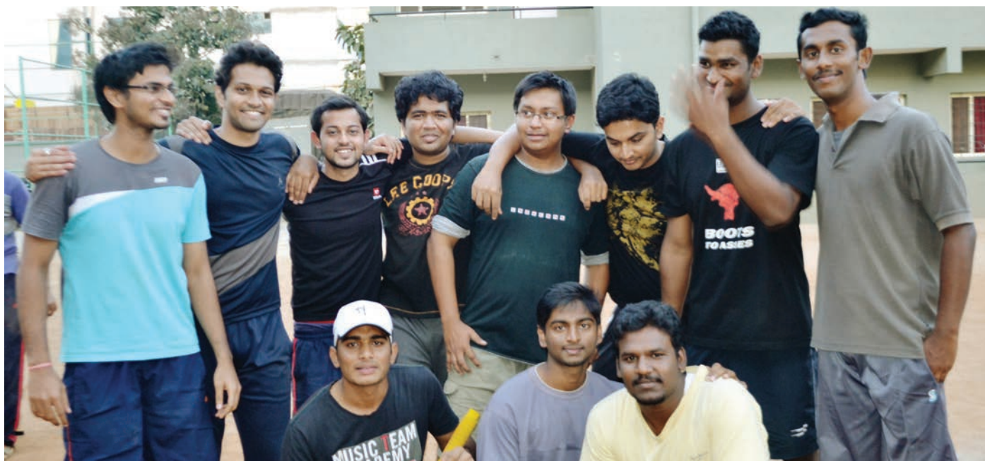
Winners of the Cricket League

Xoccer Liga, XIME's own football league started on the 17th of October, 2013 and had 6 teams fighting it out for the winners' title. The teams were Avengers, Thunderbolts, Space Monkeys, Striking Pandas, Underdogs and Victorious Secret. These teams comprised of students from batches 18 and 19 it was a real tough fight to the top. There was also a marketing event as part of the league. It was a competition among the teams as to who put in the best marketing effort for their respective teams. This event was won by the Space monkeys. The final league match was played on the 26th of October, 2013 and the Thunderbolts marched their way to victory by defeating the Avengers.