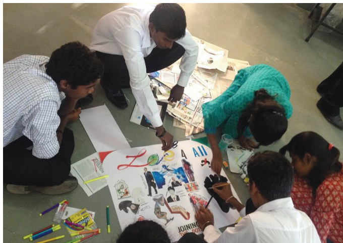
An activity session in progress

On 14th November, 2013 XSeed invited students from Shanti Bhavan, Hosur to celebrate Children's day at XIME. Various activities like Poster making, public speaking and games were conducted for the group of forty children. The best student was presented with the Sujith Valsalan Memorial Scholarship of Rs. 10,000/-