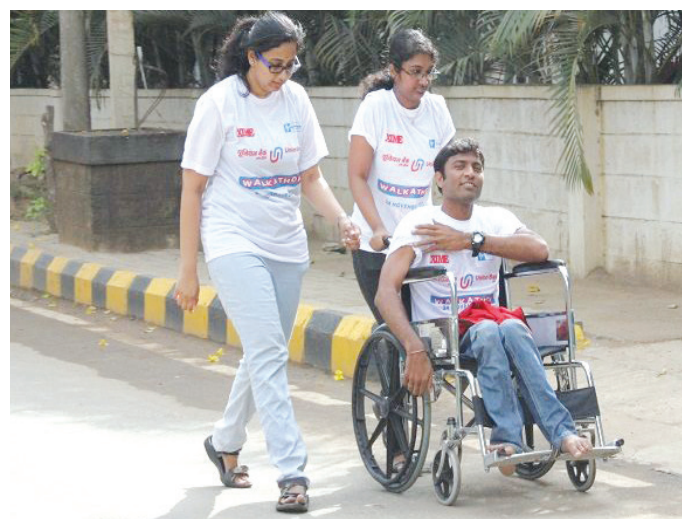
The real inspiration