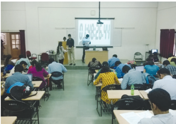
Students participating in Logo and Tagline event

Street Smart was a three level event, focussed on the abilities of the participants to think on their feet and act wisely.