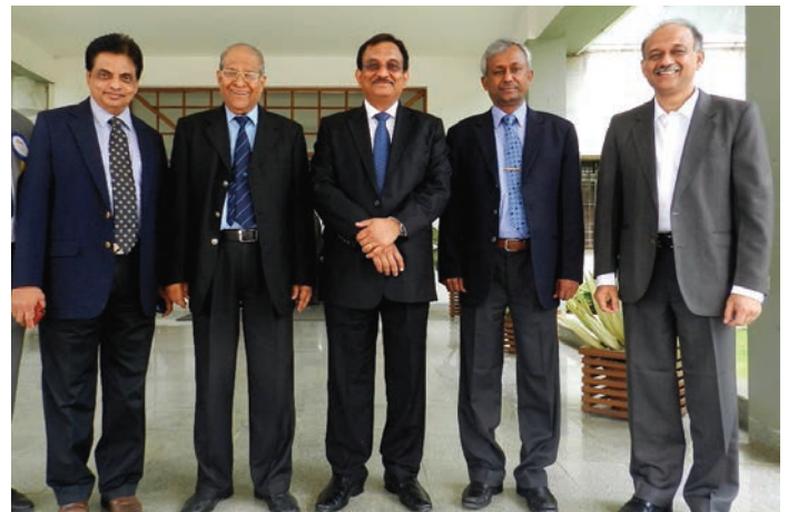
Some of the Dignitaries at the Colloquium