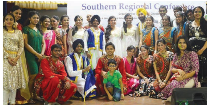
The group of XIME students who presented a cultural show at ISTD conference