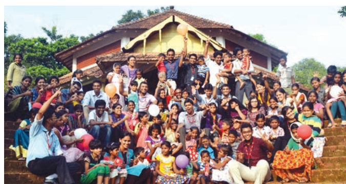
XIME Kochi students at SOS Village

On 30 November, XSeed club of XIME Kochi kick started with its first activity. A group of 25 students from XIME Kochi went to SOS Children's village, Alwaye and conducted some events for the children in the SOS village.