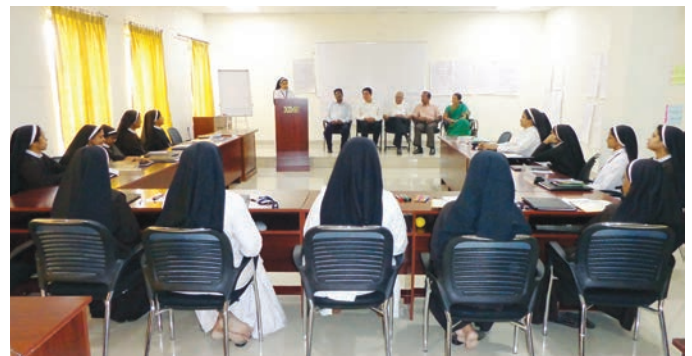
A session in progress at the workshop

A Faculty Development Workshop was conducted during the period 13 th to 22 nd September 2013 at the XIME Kochi Campus. The participants were principals and senior teachers of ICSE schools of Congregation of the Mother of Carmel (CMC). There were eighteen participants attending this programme who benefited from different activities and lecture sessions of the Workshop.