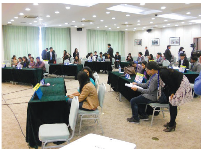
A Workshop in progress at the BRICS Students Meet in Shanghai