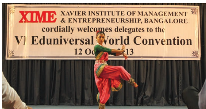
A dance performance at the Institute welcoming the Delegates